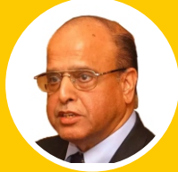
Padma Vibhushan Dr. K. Kasturirangan Chairman, National Education Policy -2020

National Education Policy (2020) - The Broad Contours